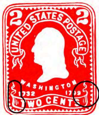
TYPE 44 5/Wh, Am, Bu.