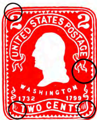
TYPE 43 3/Wh, Am, B1, Bu; 10/Wh; 13/Wh, Am, B1, Bu.