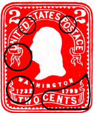
TYPE 136 13/Wh, Am, B1.