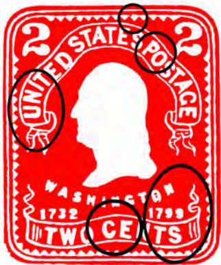
TYPE 135 5/Wh, Am, B1, Bu.