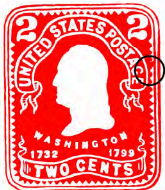
TYPE 44A 5/B1.