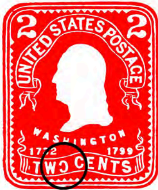
TYPE 134A 8/Wh.